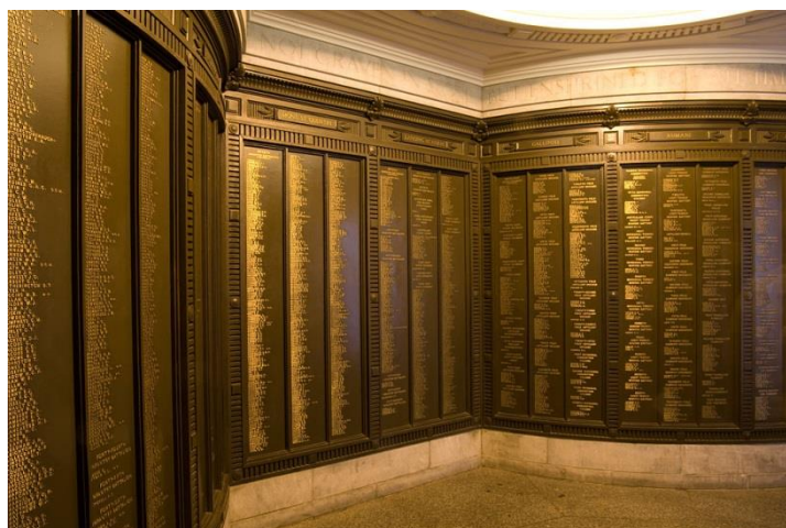
National War Memorial – Adelaide